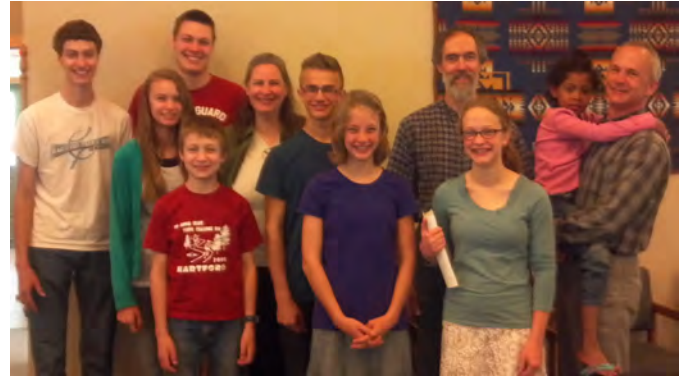
Work Group from Hartford, Wisconsin