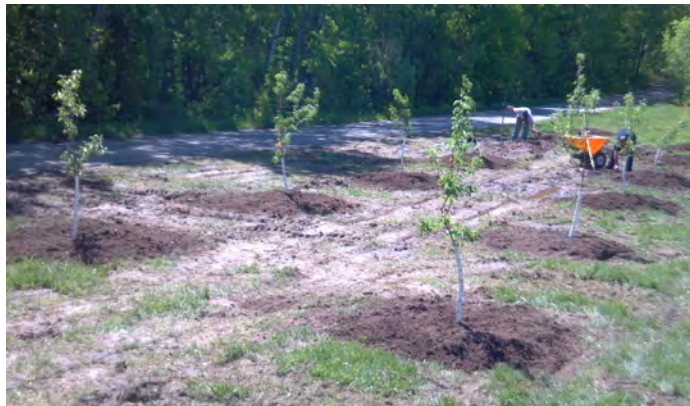
Apple trees being planted and the Pantry Garden