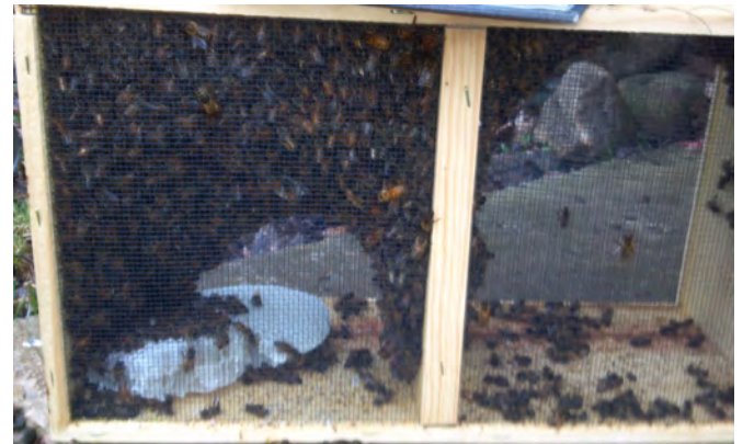
Micah's 10,000 new friends (bees)