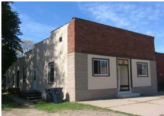
Transitional Housing Unit

Mouthwash, razors/shaving cream, deodorant garbage bags: 55 gallon cleaning supplies - floor, toilet and sink Windex, laundry detergent, dryer sheets, Downy, new adult socks, batteries - 9 volt, C, D 8 ½ x11 copier paper - # 10 Envelopes Gas Cards: Mobil-Citgo-Shell-Marathon