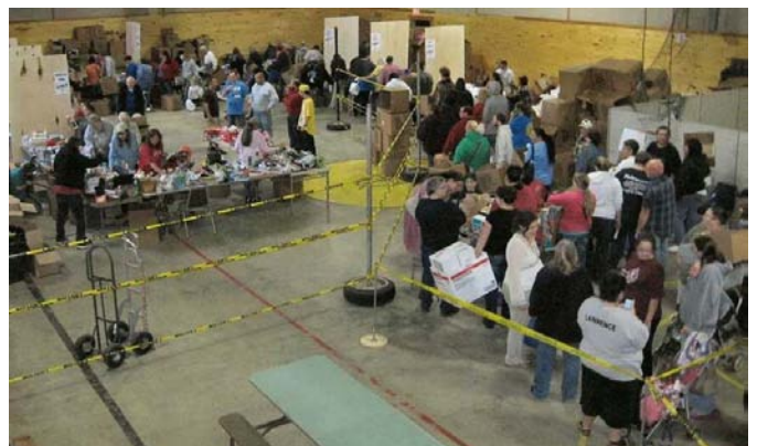
Walgreens Truck Giveaway - October 11, 2014