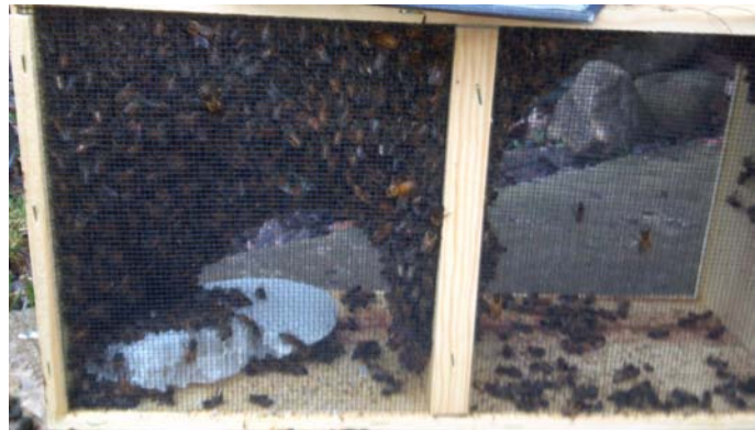
10,000 of Micah's 40,000 Bees