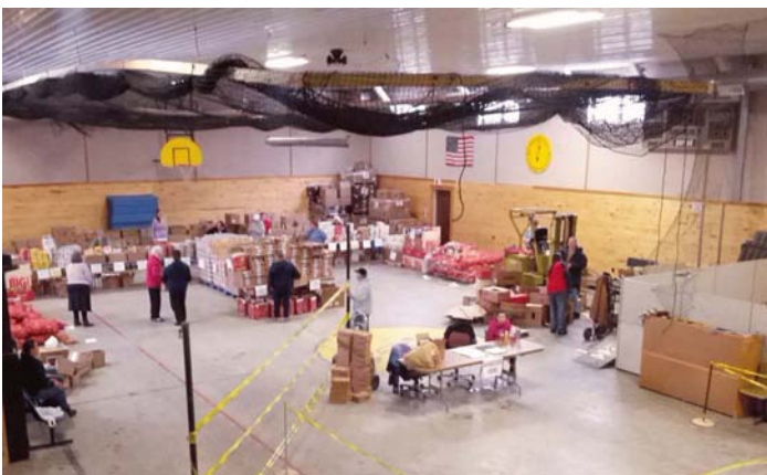
Mobile Pantry in March