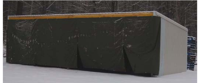
Machine Shed Now Completed