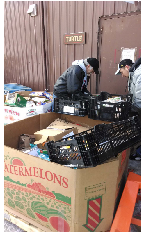
Moving food to the pantry