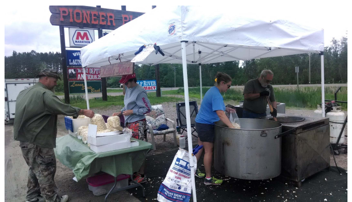
Fund Raiser for summer events: Kettle Korn