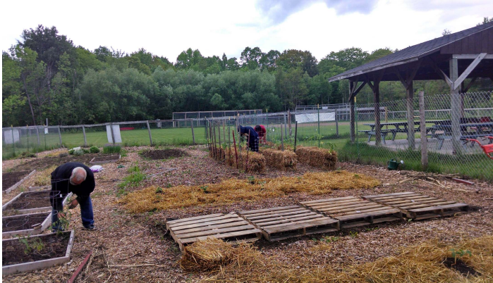
Garden and Straw Bale planting