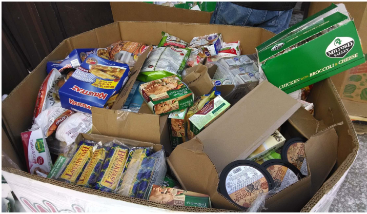
Sorting Food received for Pantry