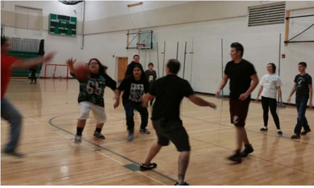
Youth Group Fun