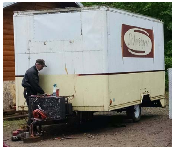
Our refrigerator unit now cooling