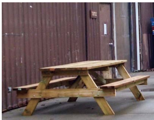
Six New Picnic Tables on grounds