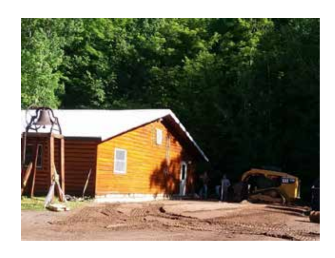
Pouring the slab for the cafeteria addition