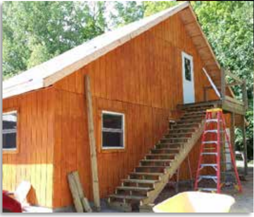
Stairs to the Upper Bunkroom