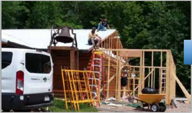
Raising the Roof