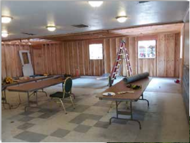
Getting Ready for Summer Camp