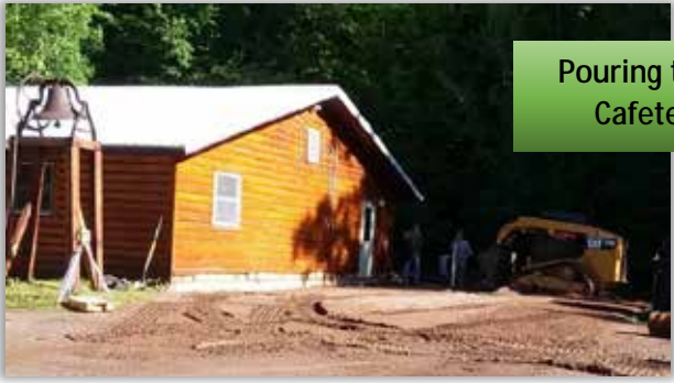
Pouring the Slab for the Cafeteria Addition