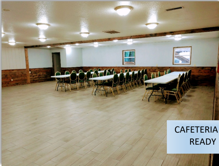
CAFETERIA TILE FINISHED READY FOR CAMP