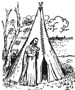
REACHING THE FIRST AMERICANS FOR CHRIST