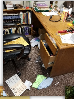
DAMAGE TO STONE LAKE CHURCH