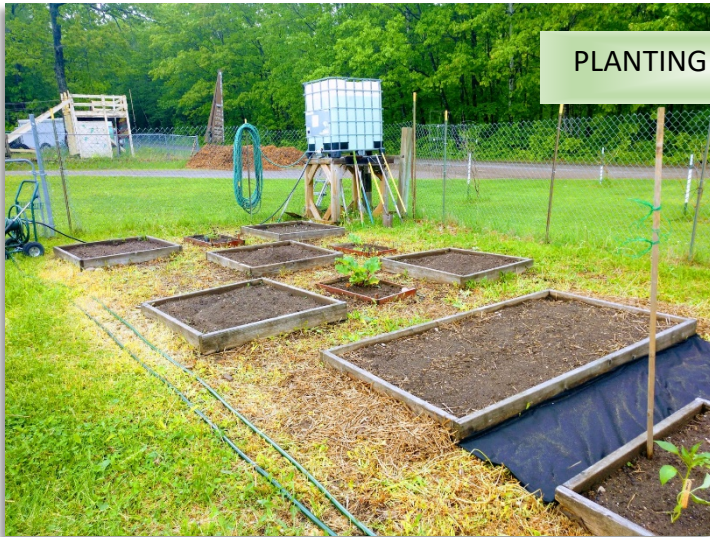
PLANTING THE GARDEN