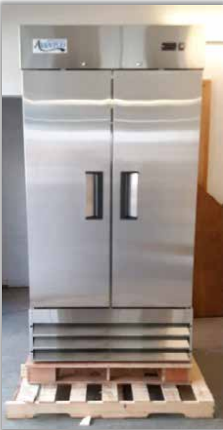
NEW PANTRY REFRIGERATOR!