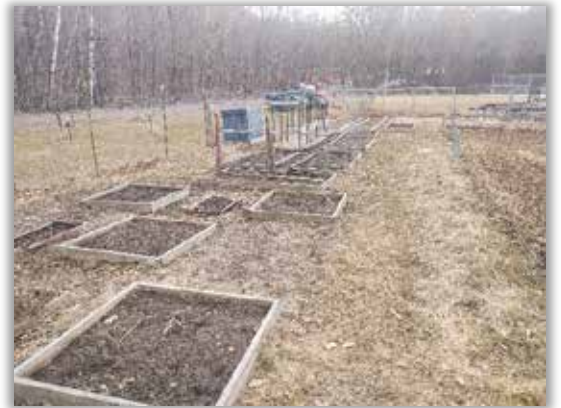
PREPPING THE GARDEN