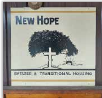
UPDATING MISSION SIGNS