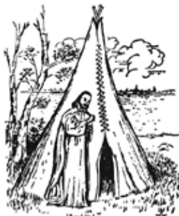
REACHING THE FIRST AMERICANS FOR CHRIST