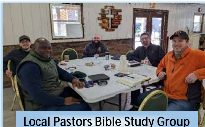
Local Pastors Bible Study Group