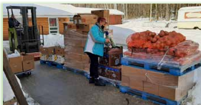
Senior Food Giveaway