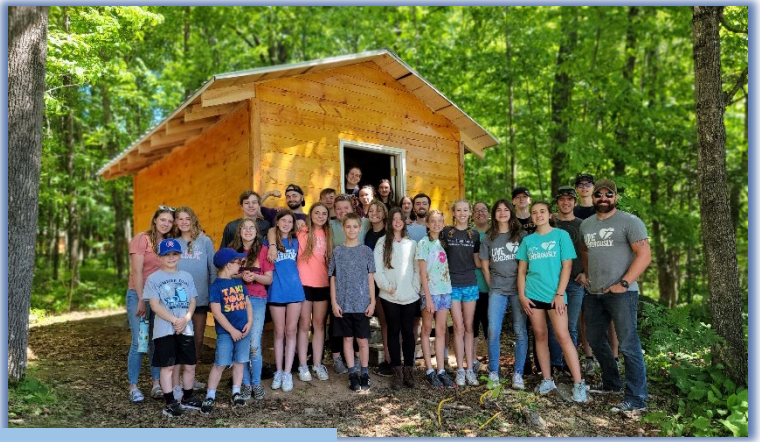
Summer Work Projects