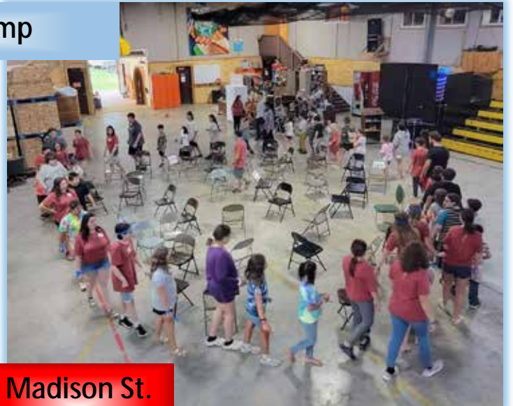
Madison St. Windows