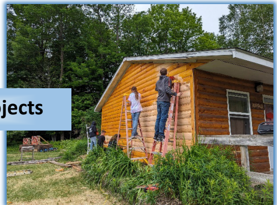
Mission Work Projects