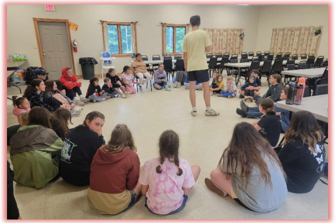
Stone Lake VBS