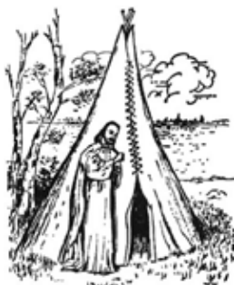
REACHING THE FIRST AMERICANS FOR CHRIST